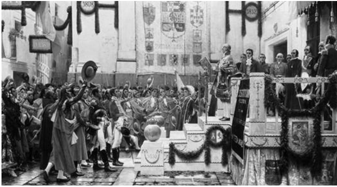
The promulgation of the Constitution of 1812, oil painting by Salvador Viniegra (Museo de las Cortes de Cádiz).

written as initial studies that highlight the limited nature of available sources and secondary scholarly studies in the field. They are first attempts to unearth the basic contours of these important, established, and relatively unknown precursors of the Florida Supreme Court.