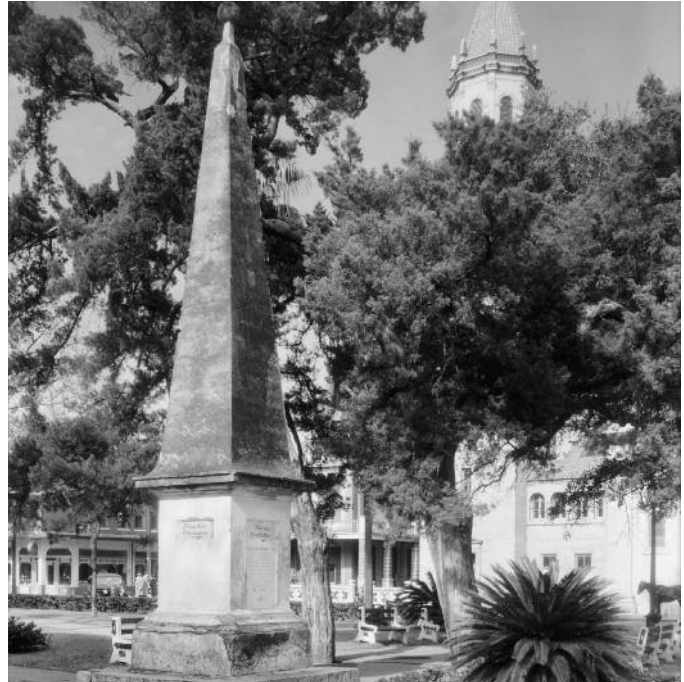
Constitution Monument in La Plaza de la Constitucion, St. Augustine. Erected 1813

Locating the records aside, a student of Florida's colonial courts must be trained in both Spanish and English and in the paleography of the period. The documents from the British courts contain pages in Spanish, and the documents from the second Spanish period contain some documents in English. Scholars need both languages to study the activities of these